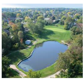
Tyandaga Municipal Golf Course - Blimp Pics