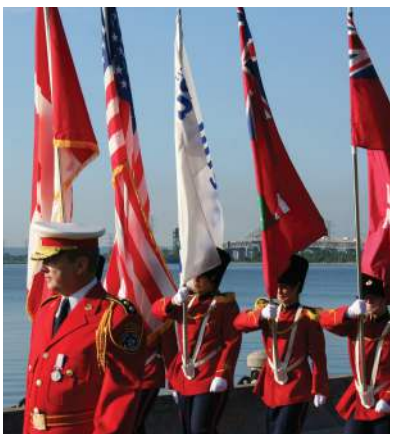
The Burlington Teen Tour Band