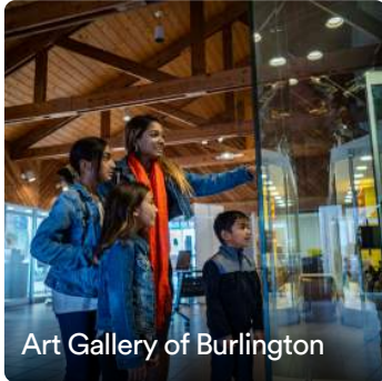
Art Gallery of Burlington

Contemporary Canadian art exhibitions and engaging group tours in a creative cultural hub.