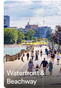
Waterfront & Beachway

Offers engaging animal experiences, scenic trails, and group-friendly programming in a beautiful conservation setting.