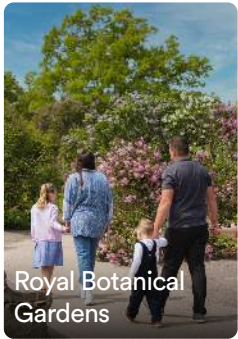
Royal Botanical Gardens

Canada's largest botanical garden with immersive group tours, nature trails, and seasonal floral displays.