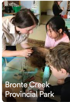
Bronte Creek Provincial Park

Educational apiary tours, honey tastings, and sustainability experiences at Burlington's top agri-tourism destination.