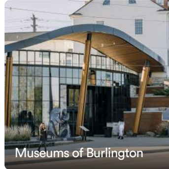
Museums of Burlington

State-of-the-art theatre offering year-round live performances with group booking options and flexible seating.