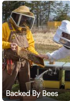
Backed By Bees

Canada's largest botanical garden with immersive group tours, nature trails, and seasonal floral displays.